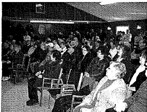
Crowd - Hay Benefit